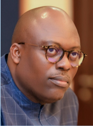
GOV SIM FUBARA