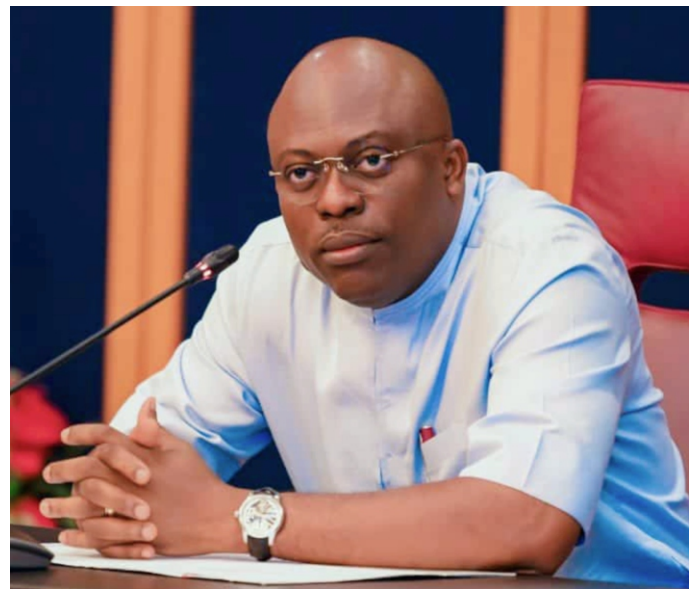
Gov Sim Fubara

Governor Fubara espoused his views, saying, "I