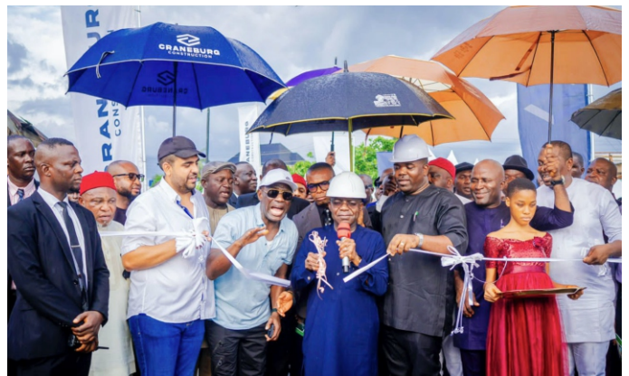
Gov. Otti at the commissioning of Udeagbala Road in Aba

Envisioned by its founding architects as a bastion of prosperity and progress, Abia State languished amidst a landscape of unmet expectations under successive administrations. The erstwhile vibrant Umuahia, the state's capital, stood as a mere shadow of a capital city and until now, remained a glorified local government while the bustling economic hub of Aba teetered on the