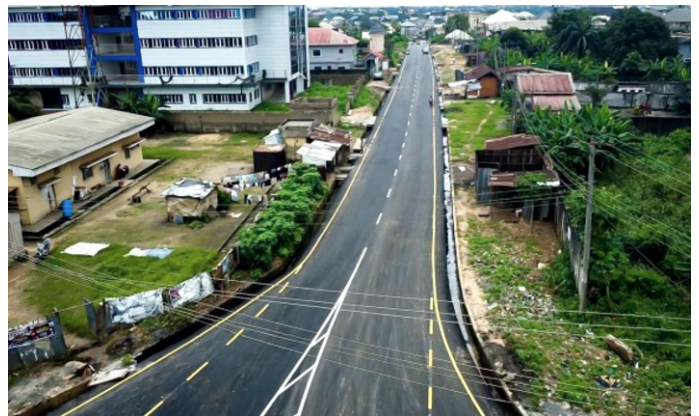
One of the roads commissioned by the governor

The collective decision of the people of the state including those in the Diaspora, to end bad governance and restore the image of the state was a practical protest that yielded results. It was not surprising that in the recent protests that characterized the push for the end of bad governance which has plagued the nation for decades and causing untold hardship for the masses, the people of