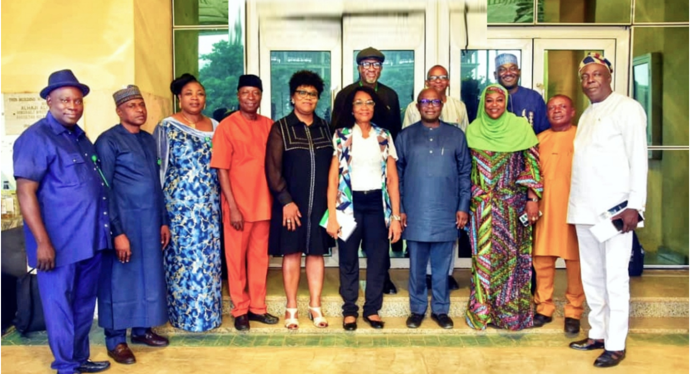
The Director General of the NATIONAL OIL SPILLAGE DETECTION AND RESPONSE AGENCY, (NOSDRA) meets with the Zonal/Field Heads as well as the Directors and Heads of Departments to present their Operational Coverage areas, natural / type of operation (Downstream, Midstream & Upstream); Staff strength and Distribution; Achievements and challenges.