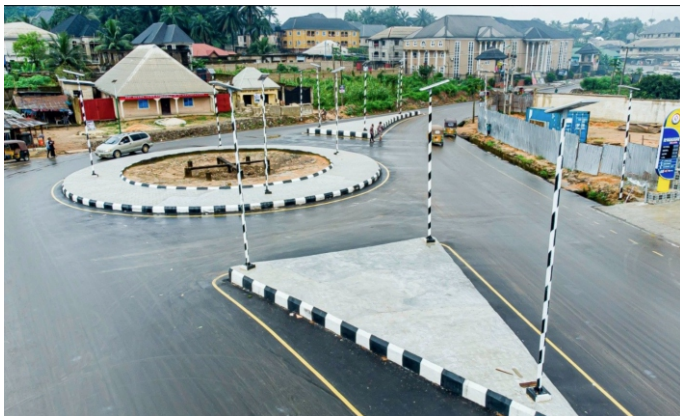
Abia First Solar Water Fountain Roundabout

In a watershed moment in 2023, a coalition comprising the clergy, traditional Rulers, and ordinary citizens convened with a resolute resolve through prayers to vanquish the spectre of bad governance that had long haunted Abia State. Galvanized by a collective sense of purpose, they