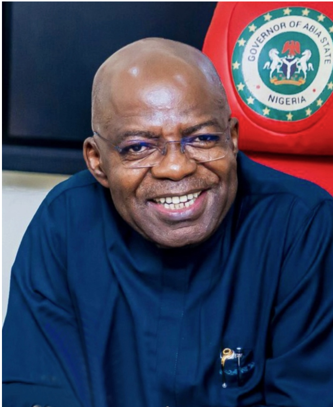
GOV. ALEX OTTI